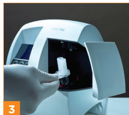
3 Insert cartridge into analyser. Results displayed within 4 minutes.