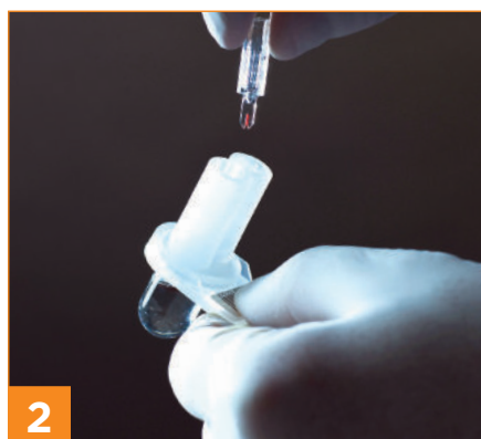
2 Insert sample collector into the Quo-Test cartridge.