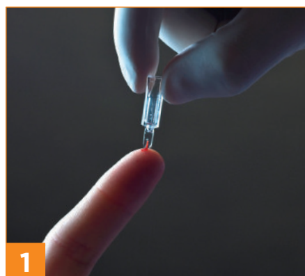
1 Collect 4 µl blood sample.